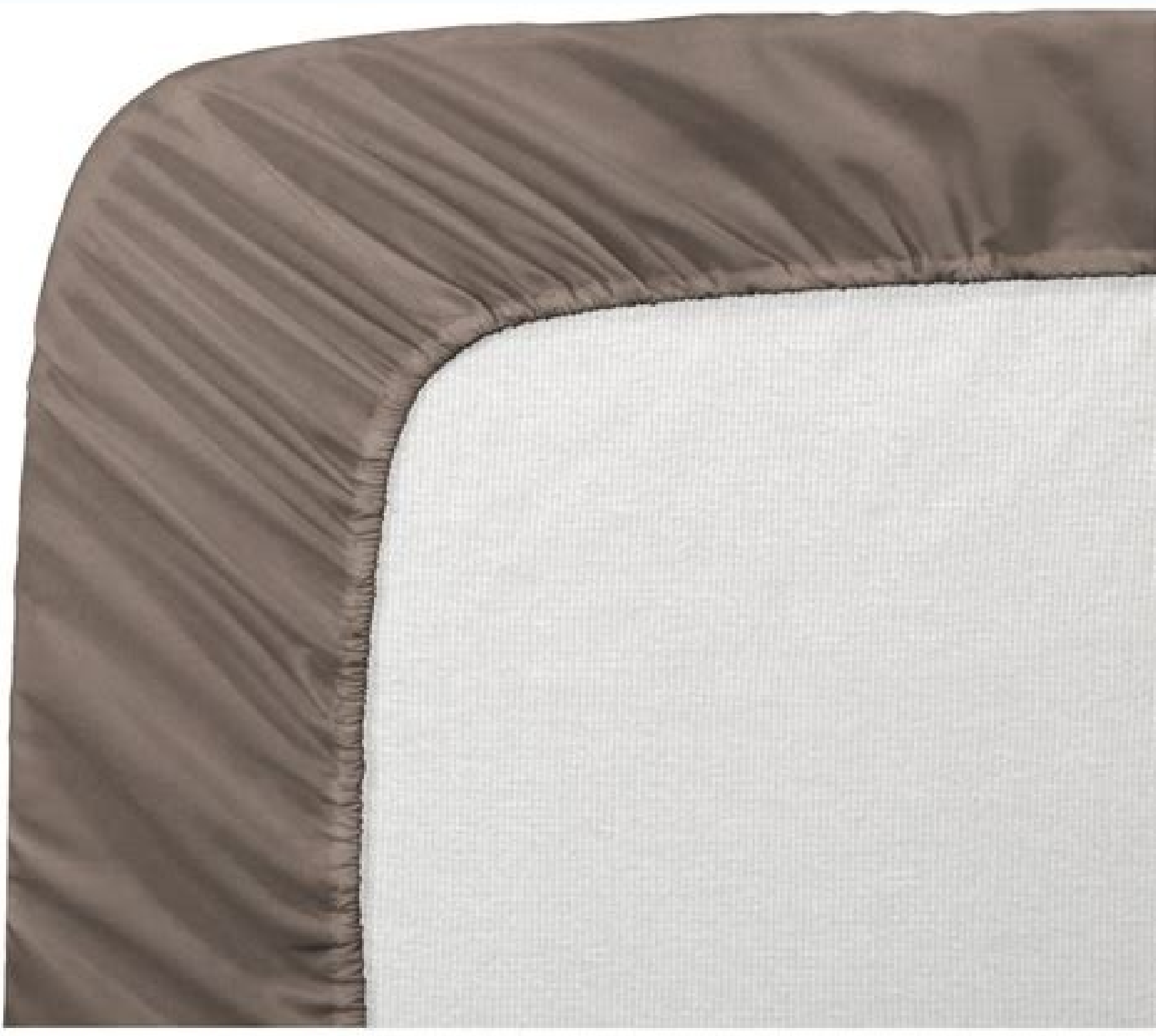
King size fleece fitted sheet